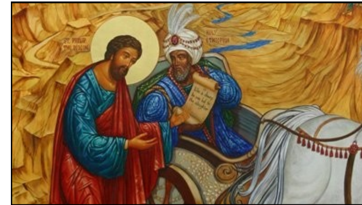
Philip and the Ethiopian Eunuch

Unison: God, you bring us together in this place. We come to be fed, to be renewed, to seek understanding. God, you challenge us in this place. We embrace the challenge, trusting that through challenge we grow in faith. God, you are revealed in this place—sometimes in shining glory, sometimes in tears and struggle. God, as we worship in this place, refresh, renew and challenge us so that we would see your awesomeness. We pray in Jesus' name, as we strive to walk the path of discipleship. Amen.